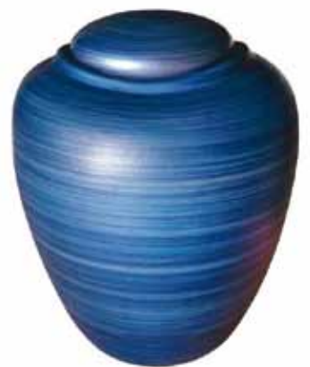
HL 98 2.70L • 23CM • 1.20KG