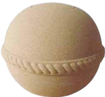
HL 101 4.40L • 21 CM x 24 CM • 2.1 KG

These urns biodegrade quickly and naturally once placed in water, water biodegradable urns are supplied with a biodegradable water-soluble bag into which the cremated remains must be placed. All water urns in this catalogue are designed to float briefly and sink intact. Float times will vary by urn and amount of remains in the urn, as well as local weather and water conditions.