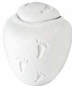
HL 107 0.65L • 13CM • 0.40KG